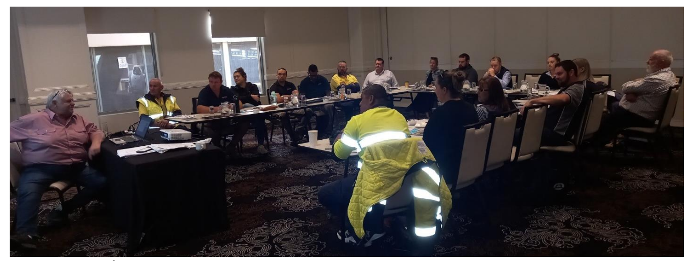
GRIFFITH, March 2021