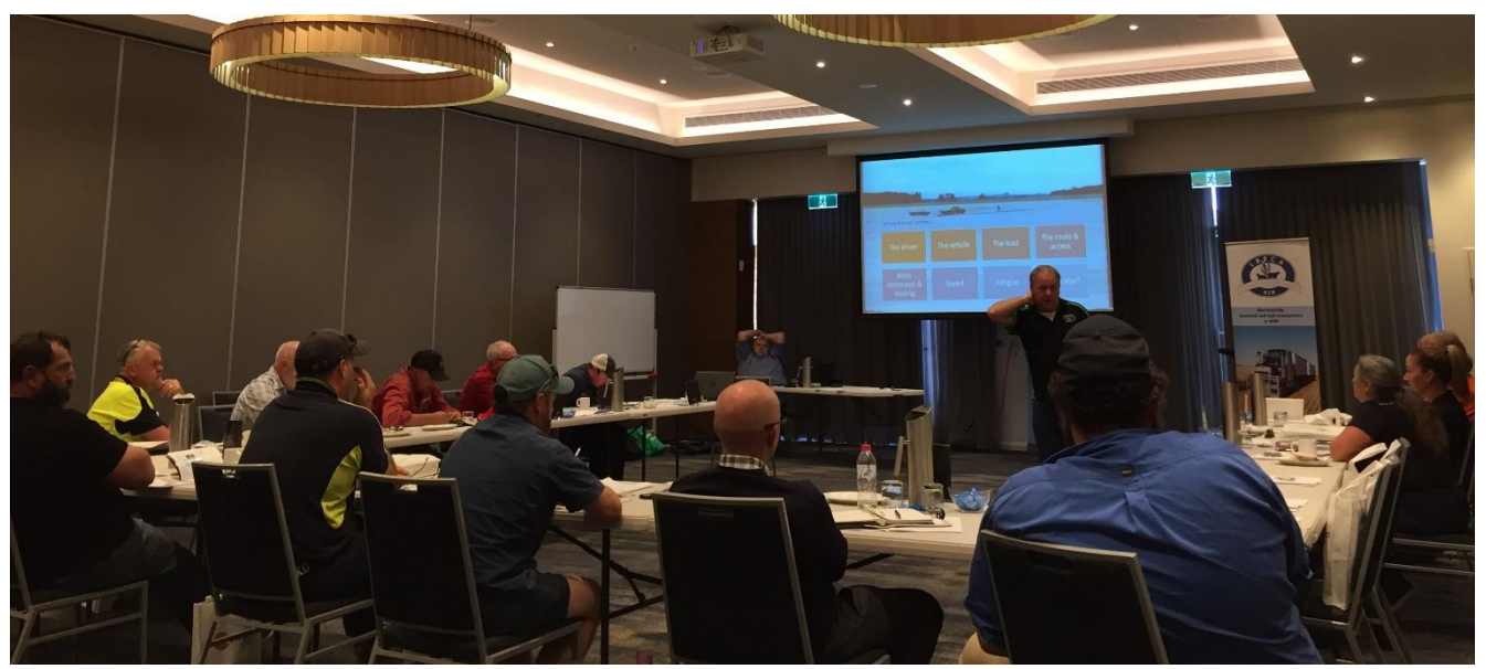
WAGGA WAGGA, November 2019