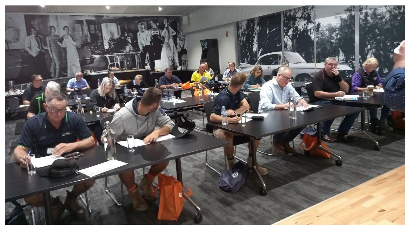
DENILIQUIN, March 2021