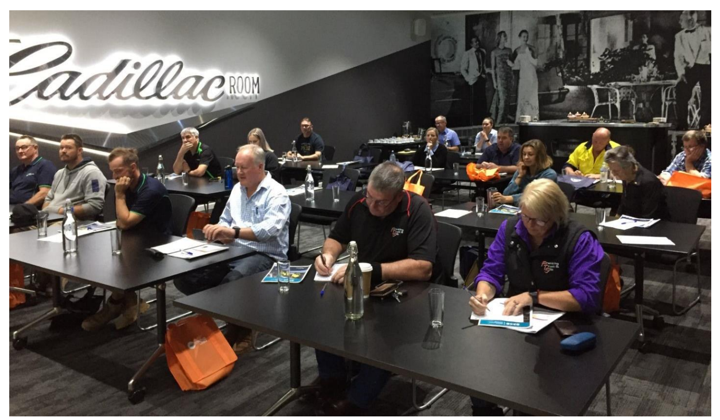
DENILIQUIN, March 2021