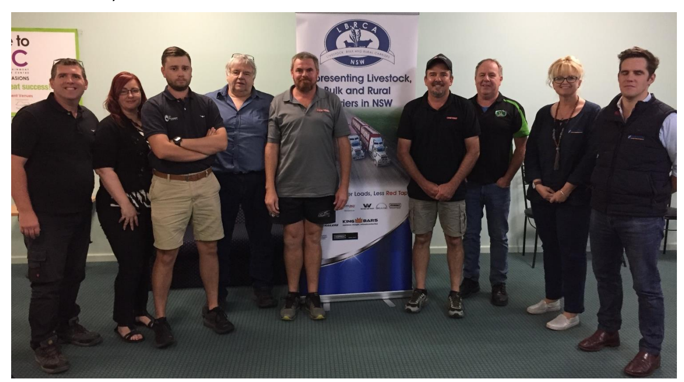
TAMWORTH, March 2020