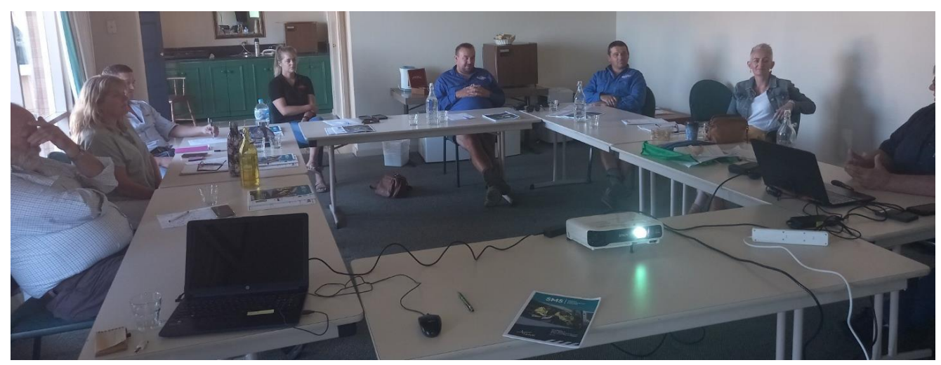
FORBES, March 2021