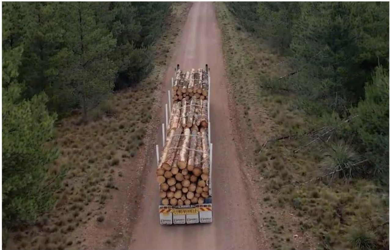
Each module is accompanied by informative learning videos.

The Livestock, Bulk and Rural Carriers Association (LBRCA) has launched the Heavy Vehicle Rollover Awareness Program (HVRAP) , a groundbreaking initiative aimed at reducing heavy vehicle rollovers and crashes and preventing the loss of life or serious injury in the Australian road freight industry.