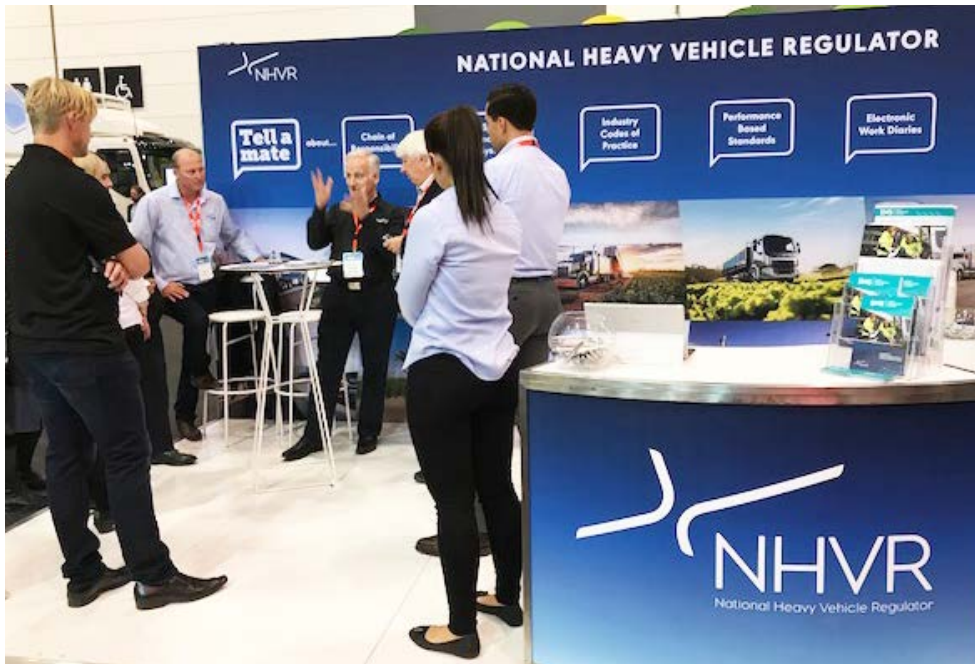
Technology providers provided a demo of a potential EWD at MegaTrans recently.