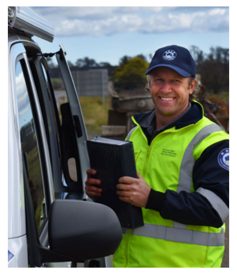
NHVR Safety and Compliance Officers will be operating in the ACT from July 1.

to occur from 1 July 2019 to have the same national heavy vehicle fatigue laws in the ACT as in Queensland, New South Wales, Victoria. South Australia and Tasmania.