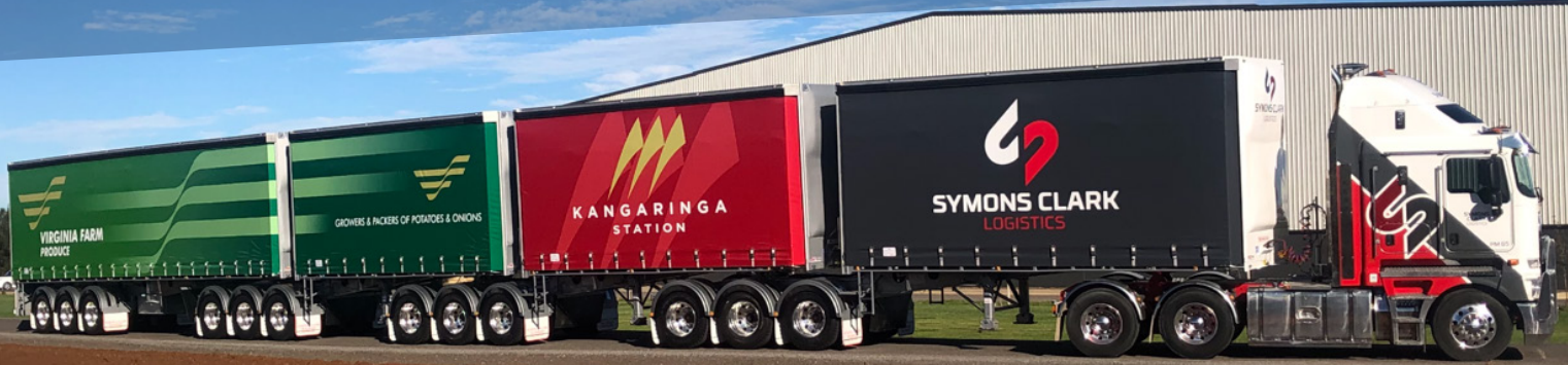
Southern Cross Trailers B-quad