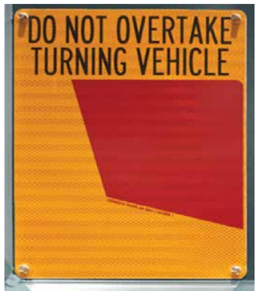
Figure 2: Example of Class 1 Rear marking plate (Category 33A)

The United Nations Economic Commission for Europe (UNECE) create internationally recognised standards used throughout the world. These standards are recognised in Australia when they are specified in an Australian law, standard or design rule.