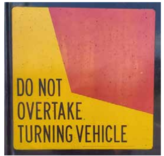
Figure 3: Example of Class 2 Rear marking plate (Category 33A)