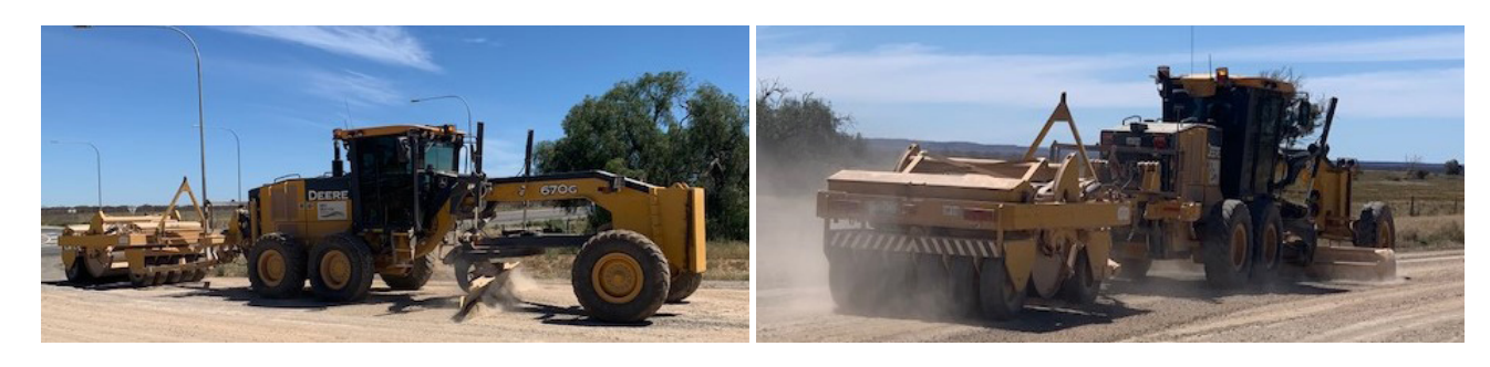
Figures 4 and 5: Motor grader towing one trailer or vehicle (maximum combination length 19m)