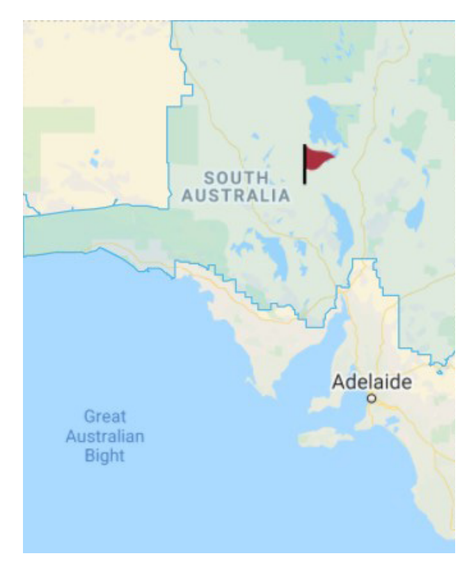
Figure 1: Pastoral Unincorporated Areas