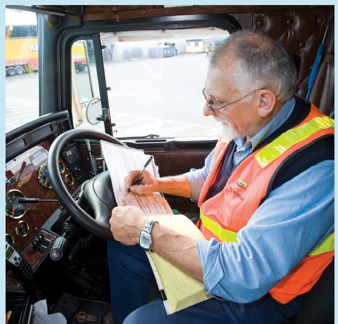
More flexible work and rest arrangements for AFM are being developed by the NHVR in partnership with industry

Once approved by the NHVR Board, the new work diary will be on sale nationwide later in 2013.